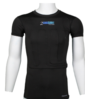
2Cool Compression Shirt