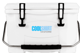
Single Person System Industrial Strength