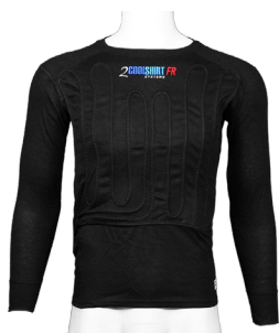
SFI 3.3 Rated 2Cool FR