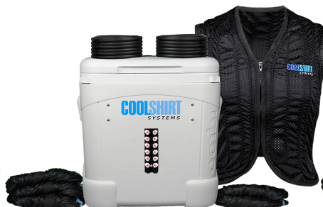
Multi-Person System Complete