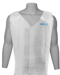
Disposable Cool Vest