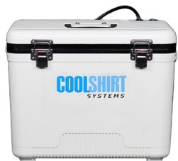
Single Person System