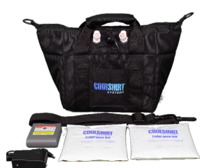
MobileCool 1 w/ Lith Kit