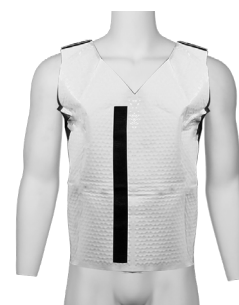
Rapid Rehab Vest