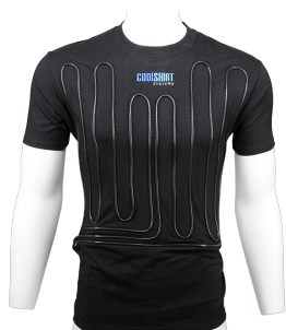
Black Cool Water Shirt