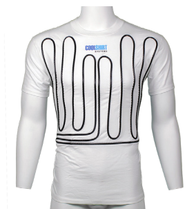
White Cool Water Shirt

*2023 pricing displayed (Subject to Change)