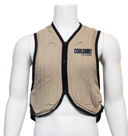
70E Rated ARC Vest