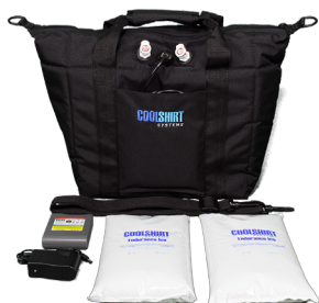
MobileCool 2 w/ Lith Kit