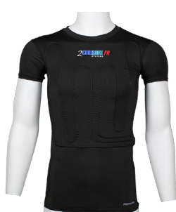
SFI 3.3 Rated 2Cool FR Short Sleeve