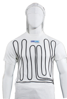
Hooded Cool Water Shirt