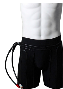
2Cool Water Compression Shorts