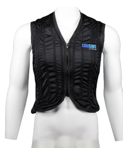
Active Aqua Vest